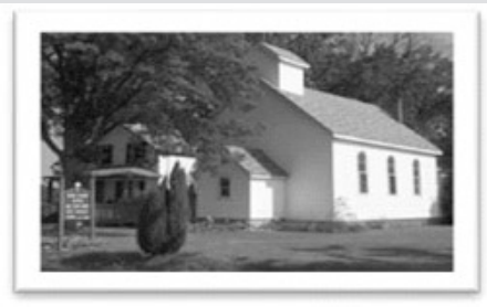
Star of the Sea